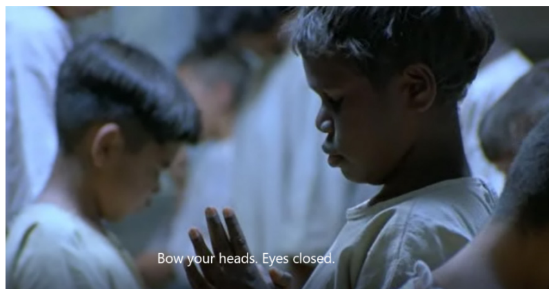
Image 6. Rabbit-Proof Fence . (2002). [film] Directed by P. Noyce. Australia: Becker Entertainment.