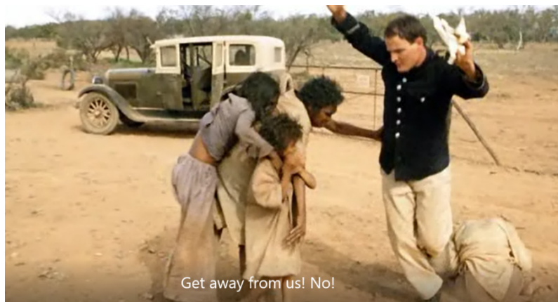
Image 3. Rabbit-Proof Fence . (2002). [film] Directed by P. Noyce.