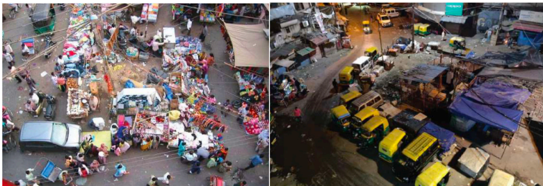
Fig: 1 Tooti Chowk, Paharganj (Tripathy J., 2020)