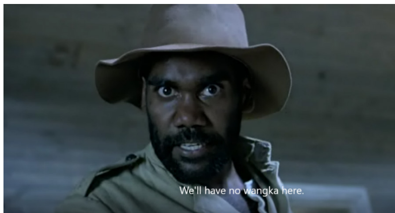
Image 4. Rabbit-Proof Fence . (2002). [film] Directed by P. Noyce.

of values by which we come to perceive ourselves and our place in the world.” (267). Colonial culture, on the other hand, implied a hierarchization of languages and “linguistic dualism”, namely it saw the language of the Empire as superior and aimed at extinguishing the language of the Aborigines called Mardu wangka (cf. Bush 2006, 126).