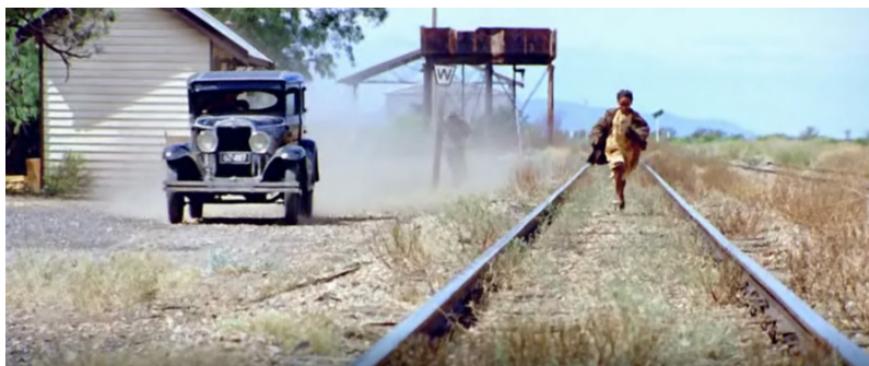
Image 1. Rabbit-Proof Fence . (2002). [film] Directed by P. Noyce. Australia: Becker Entertainment.

Pilkington accordingly explains the difficulties she encountered during the writing of her novel, because the landscape she tried to depict in her literary work has completely changed, which meant that partially she had to rely on her imagination: