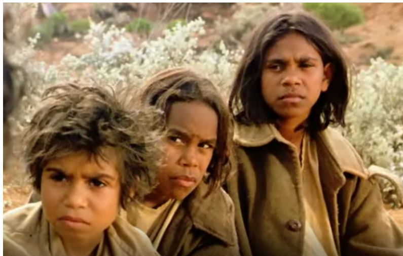
Image 2. Rabbit-Proof Fence . (2002). [film] Directed by P. Noyce. Australia: Becker Entertainment.

this by describing the children of mixed indigenous descent being rejected by the indigenous community they live in due to their insufficient blackness.